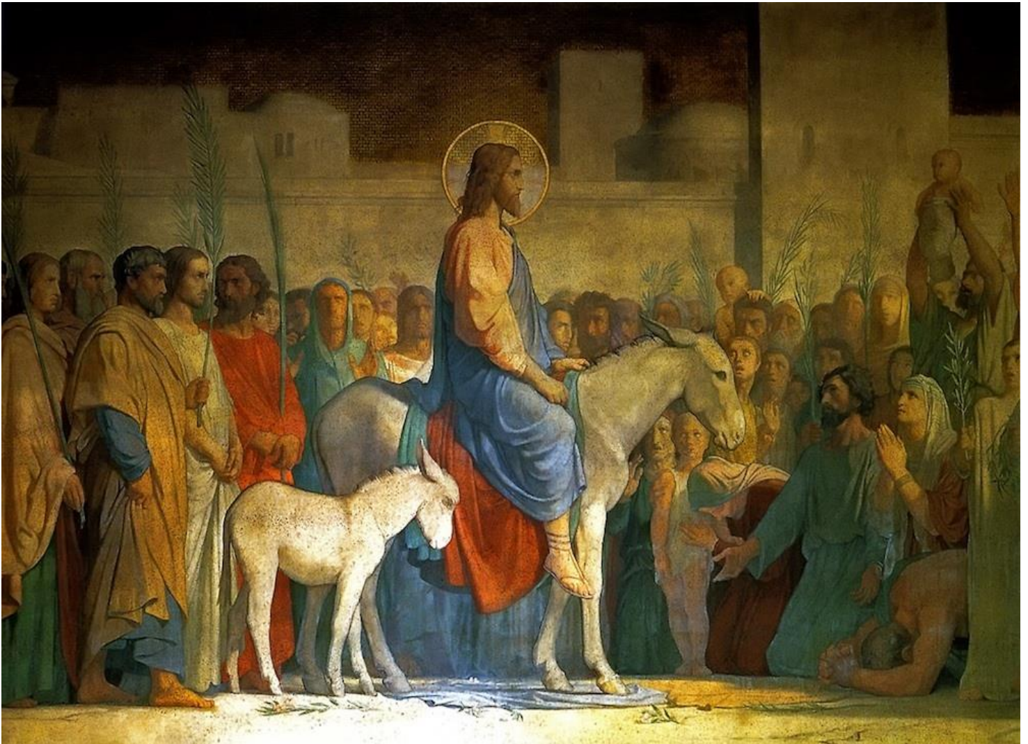
Christ's Entry into Jerusalem by Hippolyte Flandrin c. 1842

Reaching Out with Nurturing Love to All People