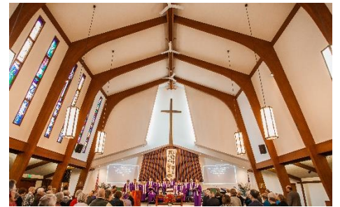
Our Beautiful Sanctuary

Congratulations! We hope your wedding will reflect the Christian traditions upon which the Presbyterian Church of the Roses is founded, as well as simple principles of good taste and planning. At the same time, your wedding is your wedding, and the staff of the Church of the Roses will do all we can to make your wedding reflect your own style and taste.