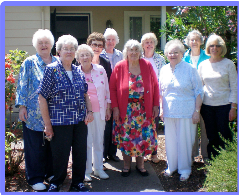
The Presbyterian Women's Coordinating Team

The Sewing Circle presents quilts to Valley of the Moon Children's Center