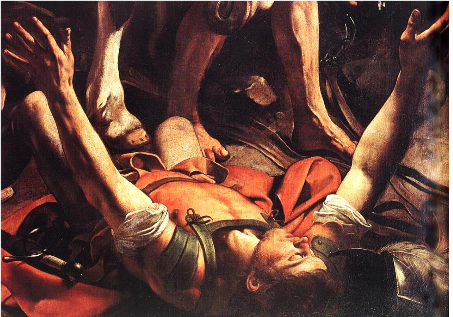
Conversion on the Way to Damascus (Conversione di San Paolo): Caravaggio, 1601

Reaching Out with Nurturing Love to All God's People