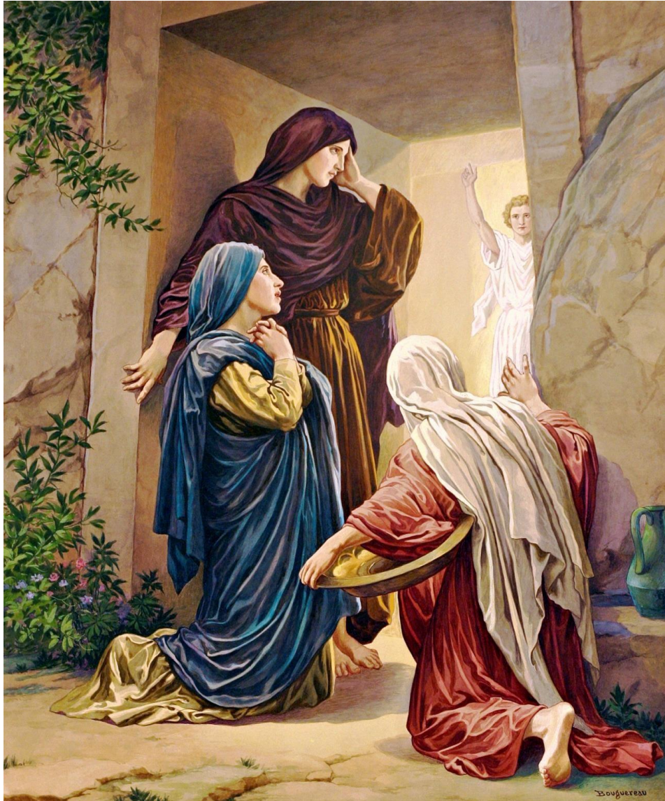
The Holy Women at the Tomb: William-Adolphe Bouguereau (1890)

Reaching Out with Nurturing Love to All God's People