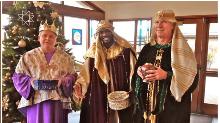
Epiphany Service: Jan. 10 th , 2016